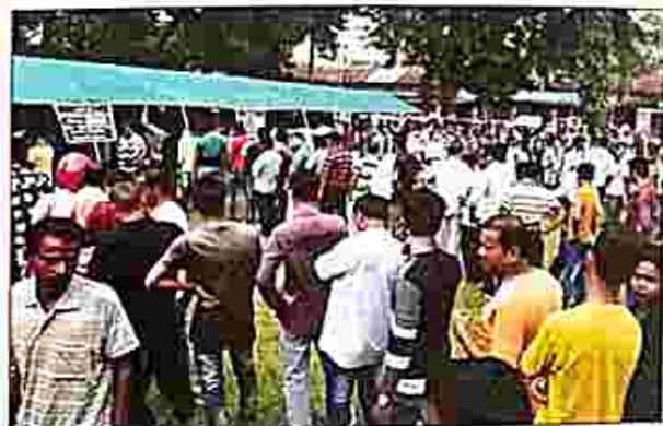
Gathering features the success of Lok-Adalat