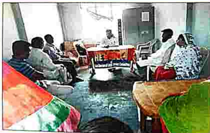
Counselling going at the office of SDLSC, Bisalgarh