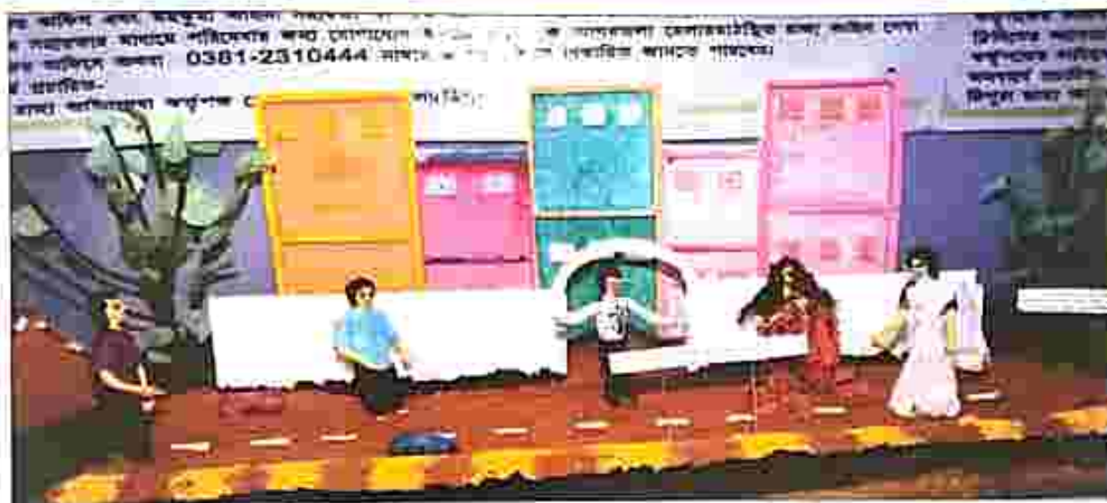
Stall depicting the legal awareness, set up by the Gomati District Legal Service Authority at Matabari temple

District Secretary, DLSA Gomati. Many other government departments have also opened their stall. Puppet show and street drama were conducted basing on legal awareness to the common people. Puppet show and drama were the point of attraction to the common people.