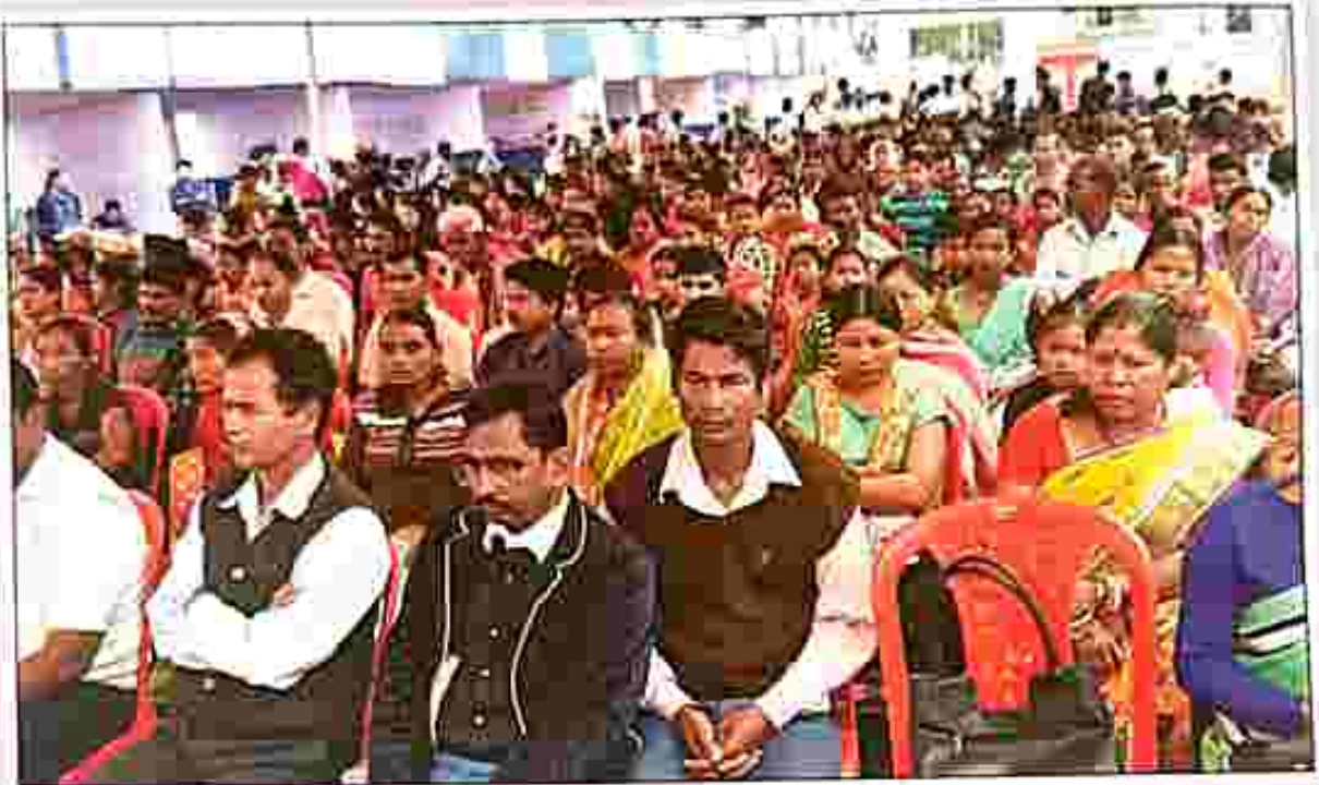
People from every section of society taking part of this programme