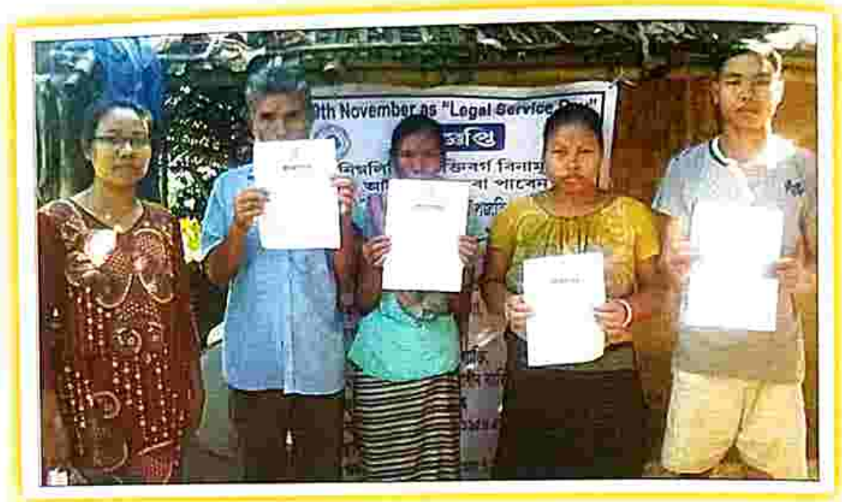
Special door to door programme at South Tripura District