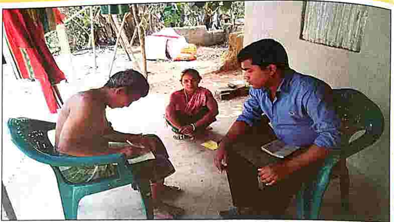
Old tribal family – head putting his signature on a Register after obtaining the benefit of door to door campaign by PLVs