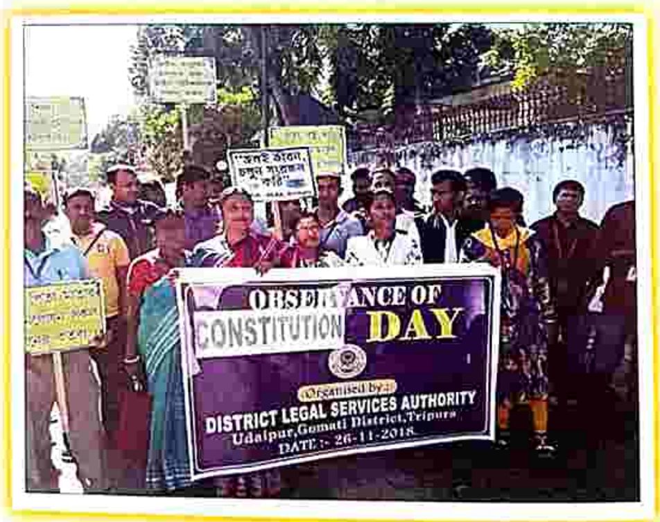
Rally on the occasion of the Constitution Day at Udaipur by DLSA, Gomati on 26th November-2018.