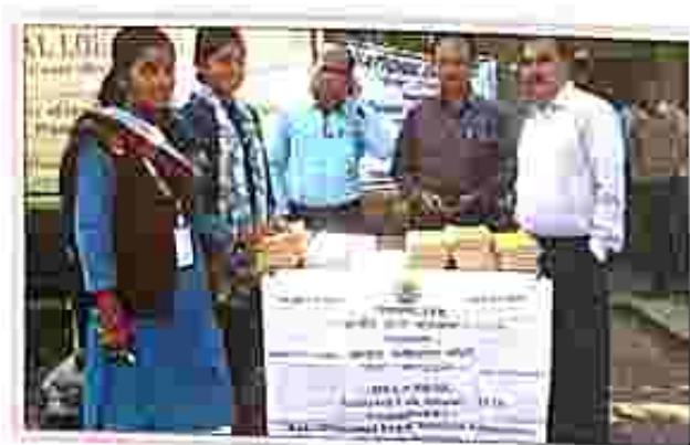
Help desk at 5 th National Lok Adalat, 2018, Agartala, organized by Sub-Divisional legal services committee, manned by active PLV