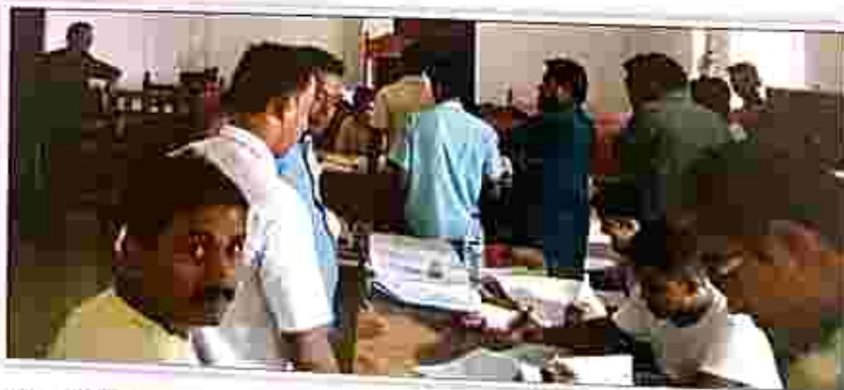
Help Desk and court activity in 5 th National Lok Adalat on 9 December 2018,