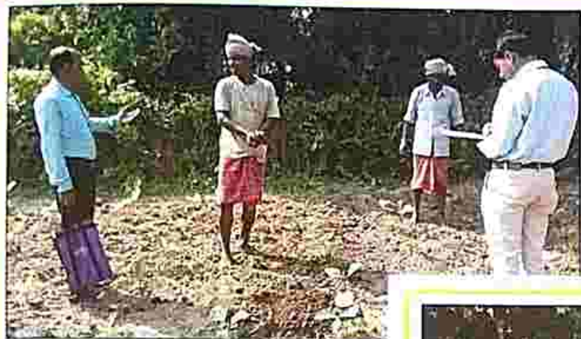
PLVs make aware to the agriculturist about their rights and remedies