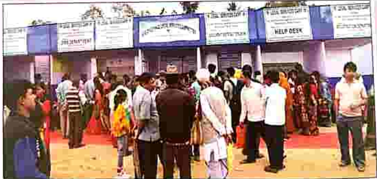
Various stall was opened by the Sub-Divisional Legal Services Committee at Kanchanpur Legal Service camp.