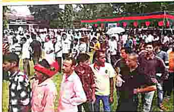
People standing in long queue for redressal