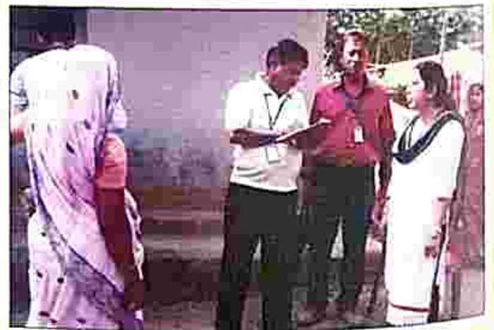
PLVs extend their helping hand to every section of society