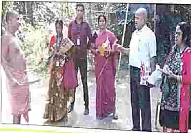
PLVs generate awareness amongst people about Adalats, conciliation, Mediation