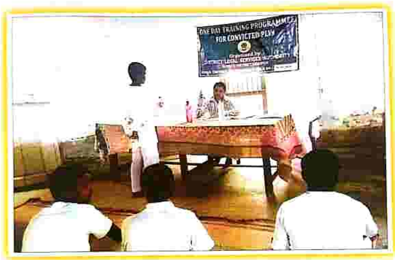
Legal awareness programme for convicts at Udaipur Jail