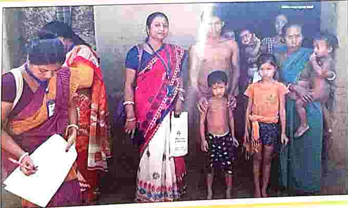
Woman PLVs jotted down the problems and sufferings of a poor tribal family