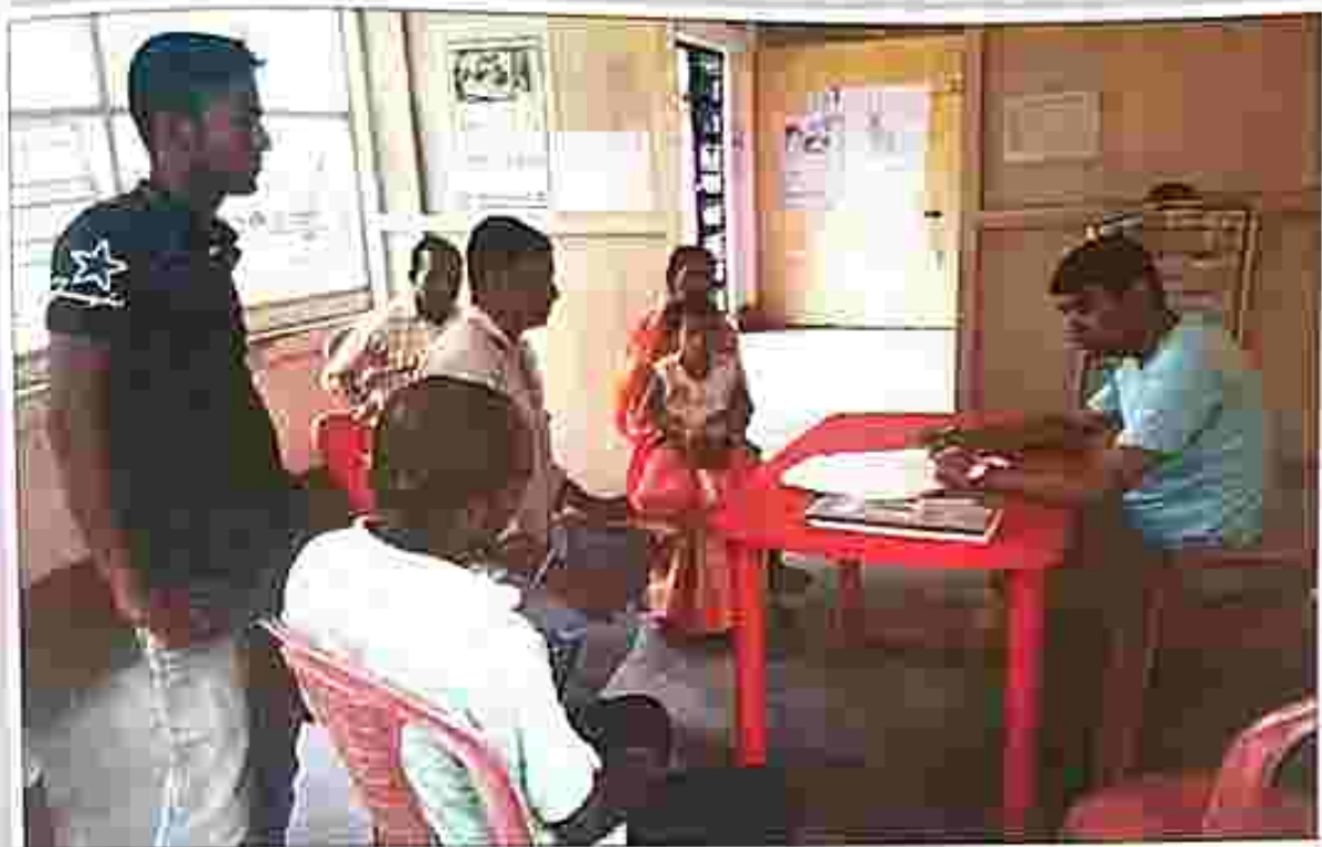
Counselling going on at Barnutia village legal care centre.