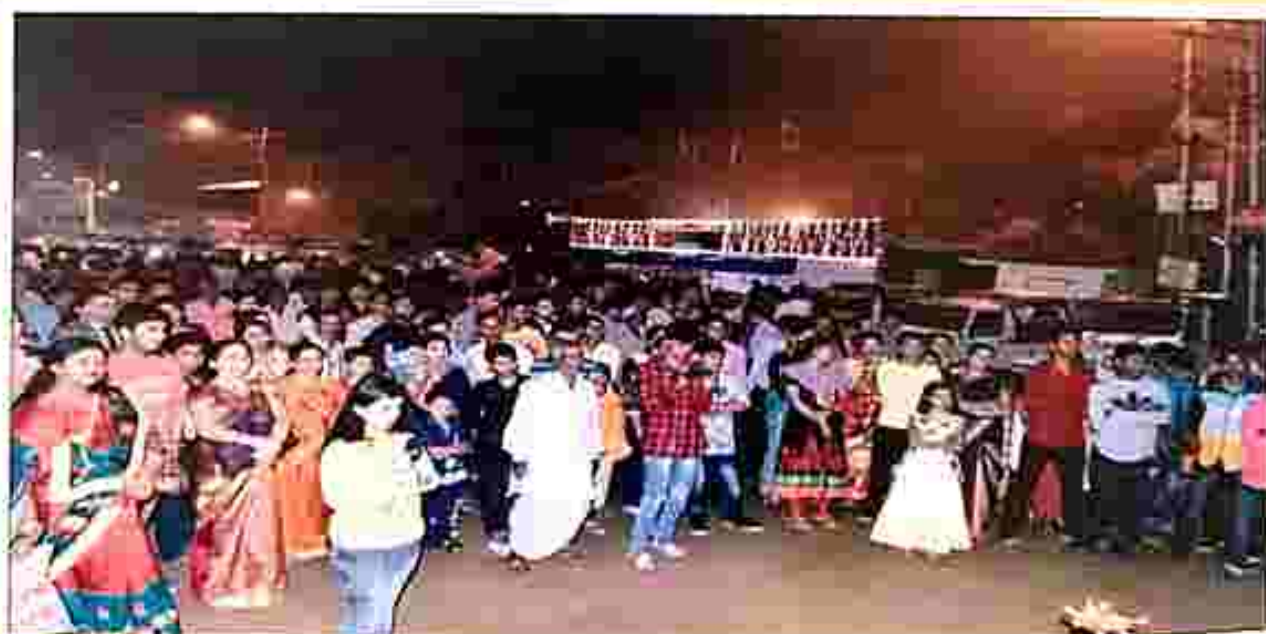
Street Drama on the theme of prohibition of dowry system. People watching and enjoying the drama.