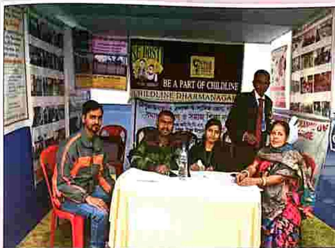
Huge gathering of Kanchanpur became witness of this Legal Services Camp