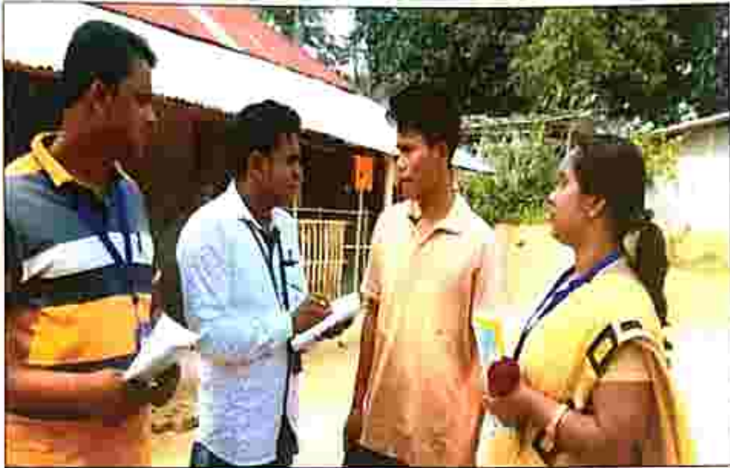
Young boy actively participates in this door to door campaign