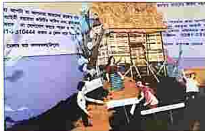
Another stall portray the interaction between the PLV unit and the tribal man about legal aid and services.