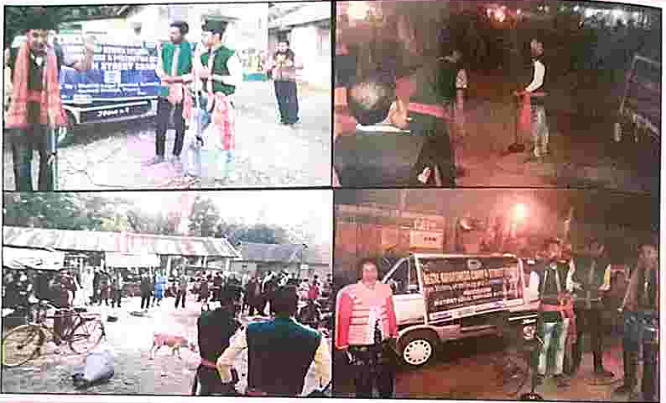
PLVs played the street dramas based on various social and legal awareness issues