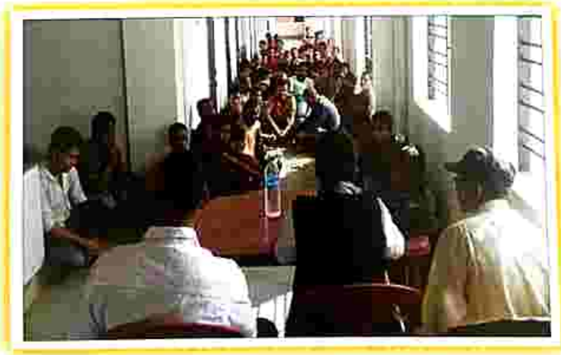
Legal awareness programme for under trial/prisoners at Sonamura Jail