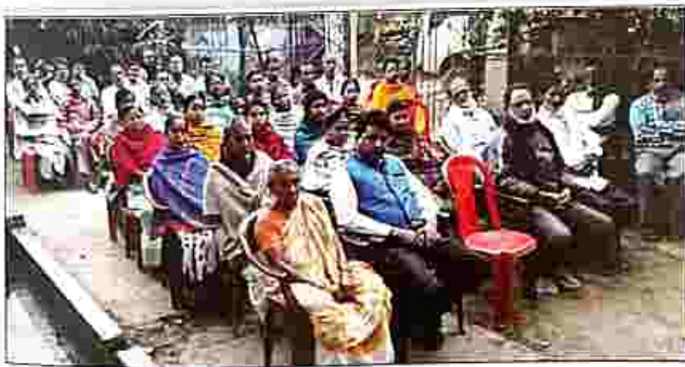
Some clips of awareness programmes in the different localities including Jail at Udaipur.