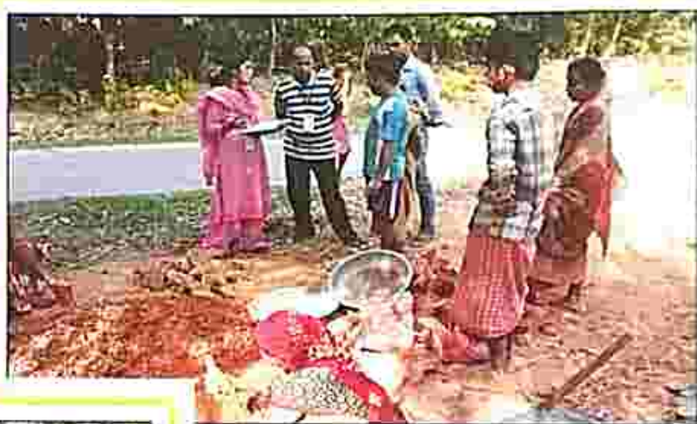
During door to door campaign PLVs reached weaker and marginalized people of the society