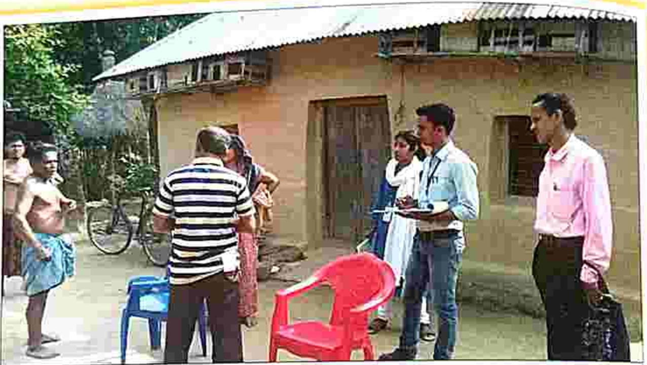
Para Legal Volunteers enthusiastically participated in door to door visit programme.