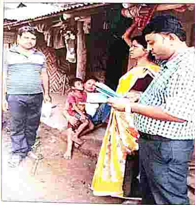
Spreading legal awareness by PLVs in far flung areas