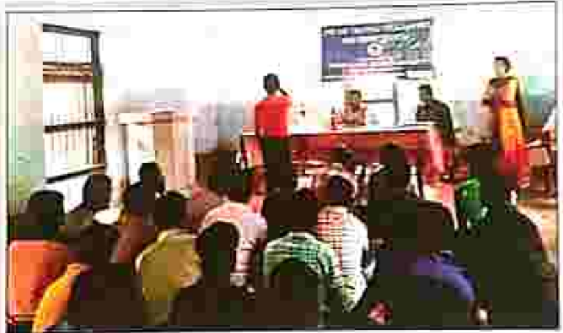
One day training programme for convicted PLVs organized by DLSA, Gomati Tripura