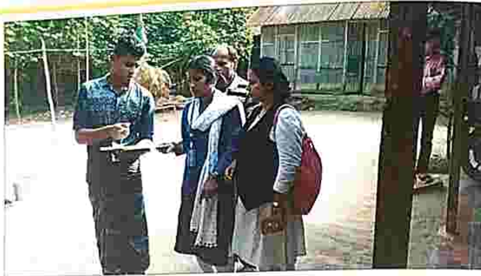
One Lady Advocate and one lady PLV actively doing their job