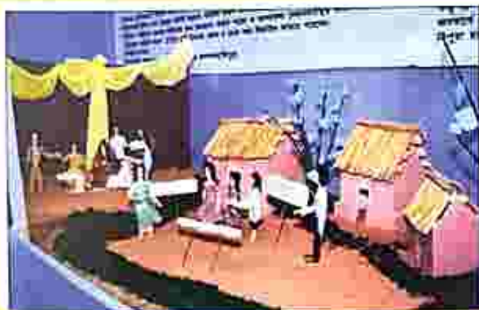
Stall themed over menace of dowry system of the society