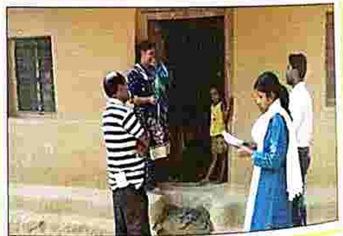
Active interaction between a village woman and PLVs during campaign