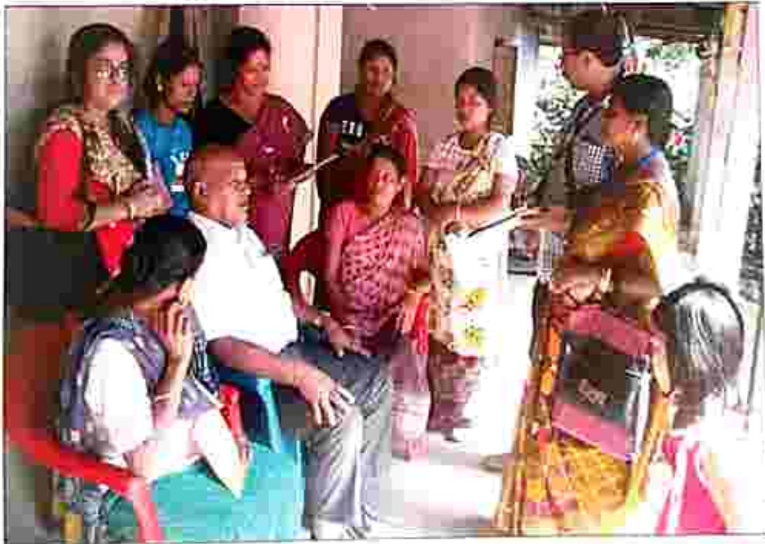
PLVs hold a schedule meeting to checking out their progress – index