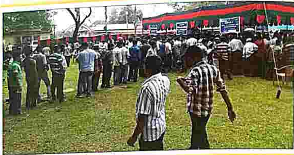
People are ardently participate in special Lok Adalat at Khowai