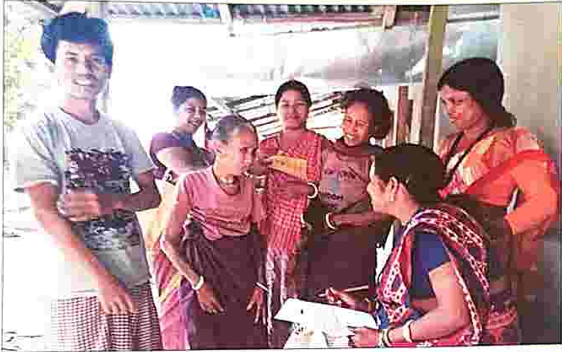
Indigenous women also coming forward to become aware of their rights.