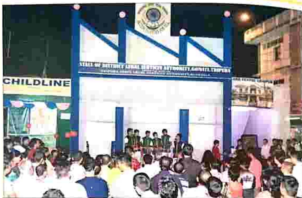
People enjoying the drama based on legal awareness by the DISA, Gomati Tripura