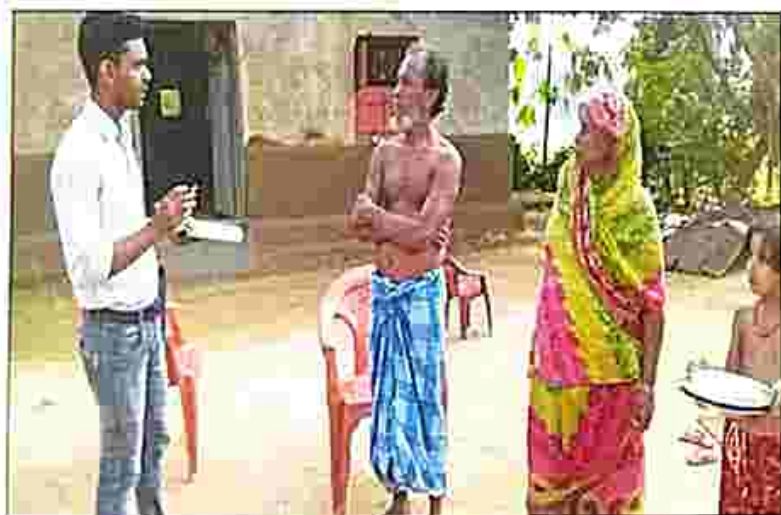
PLVs giving information to the people about the legal service activities of DLSA /SDLSC