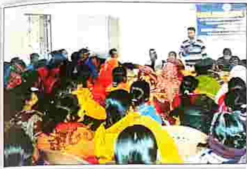
Legal Awareness camp organized by the DLSA, Gomati Tripura on NALSA legal services for the under privileged section of the society