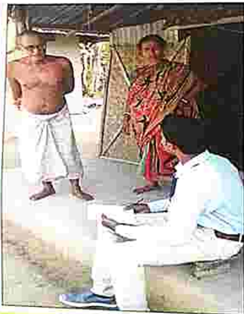
PLVs have visited several houses in different and remote parts of the State