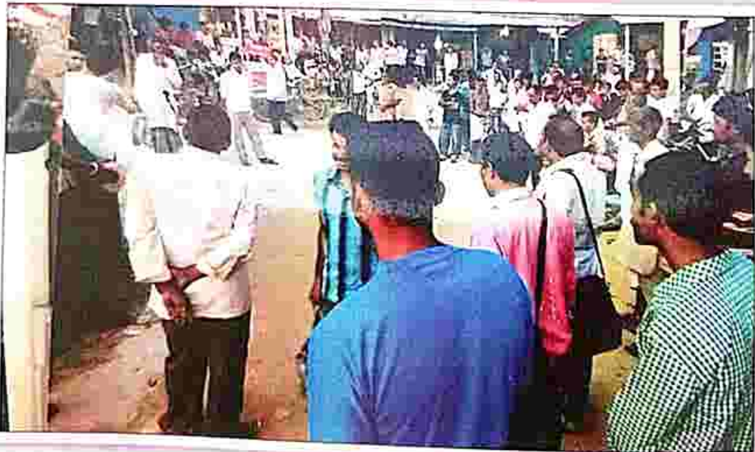
Scenes of street drama performed by PLVs of DLSA, Gomati District on 26 December 2018 at Atharabhola ADC Village