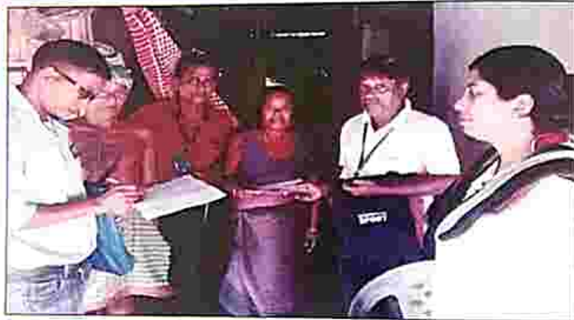
PLVs taking notes from the villagers about their problem