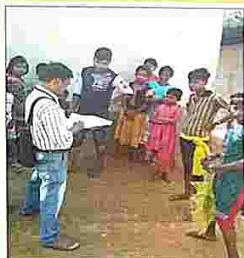
Children also ardently gathered knowledge about their rights and remedies