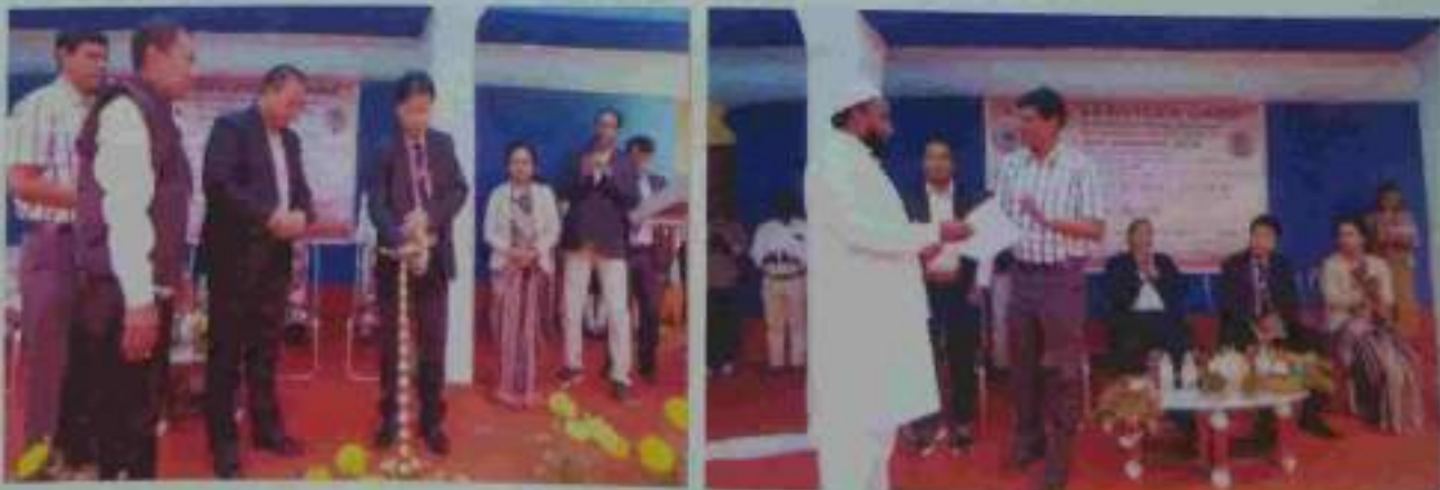
PHOTO SHOTS OF LEGAL SERVICES CAMP

A play on Child Marriage was also organized by the volunteers on that day depicting the evils of child marriage.