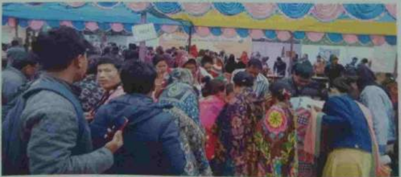
PHOTO SHOTS OF LEGAL SERVICES CAMP