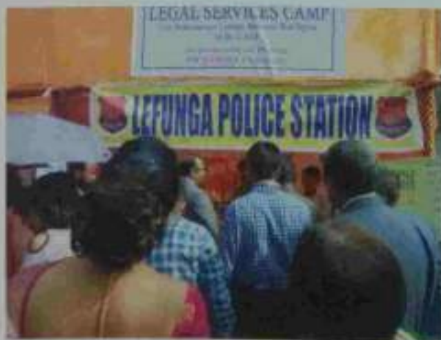
PHOTO SHOTS OF LEGAL SERVICES CAMP