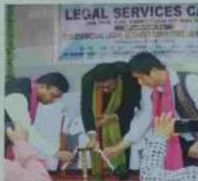
PHOTO SHOTS OF LEGAL SERVICES CAMP