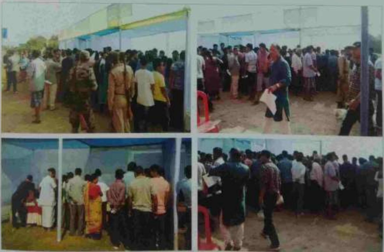
PHOTO SHOTS OF LEGAL SERVICES CAMP