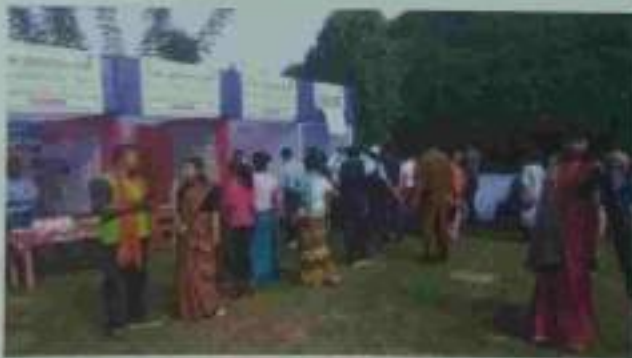
PHOTO SHOTS OF LEGAL SERVICES CAMP

In the Camp, different Govt. Departments had participated and opened their Stalls and display the various beneficial schemes of the Union and State Governments for the citizen. The participants receive information as to how the benefits of the schemes are to be taken and they were highly pleased and happy to know about the schemes. The camp was attended by 550 beneficiaries and as many as 140 certificates were distributed.