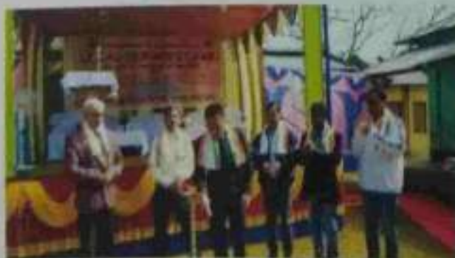
PHOTO SHOTS OF LEGAL SERVICES CAMP