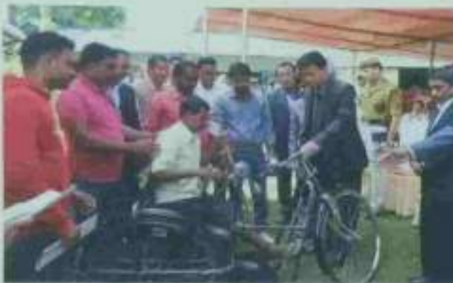
PHOTO SHOTS OF LEGAL SERVICES CAMP

Chairman, DLSA, Unokoti District with other dignitaries were present at the camp. Adhaar Card, ST, SC, OBC, marriage certificates along with other articles were distributed among the beneficiaries in this Camp and as many as 11 nos. of Govt. & other Departments had participated and opened their Stalls. Almost all villages under Pecharthal area were covered by this camp and more than three thousand people attended the camp and 1664 certificates, cycles for girls student of the schools and cycle for disabled people and various other articles were distributed to the beneficiaries.