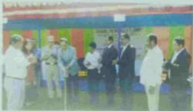
PHOTO SHOTS OF LEGAL SERVICES CAMP